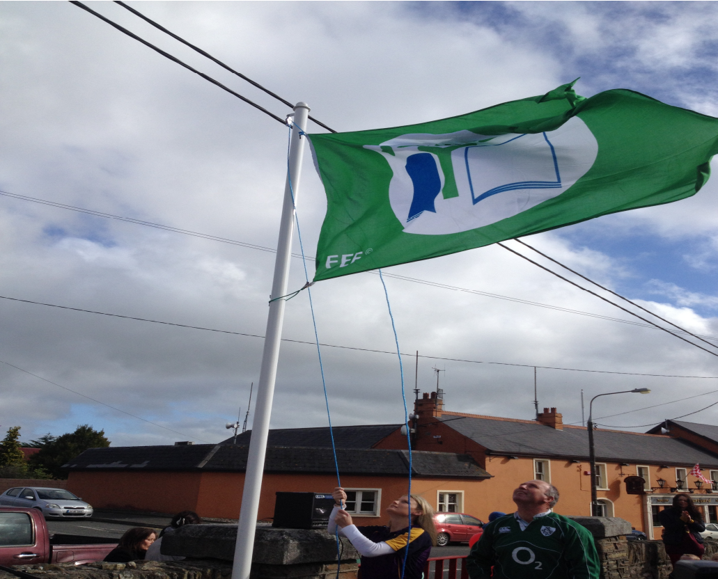
The second flag is for Energy and the children are busy working towards this flag with the visit from the energy cabin.

Members of Scoil Naomh Maadhóg's Green Schools Committee travelled to Kilkenny to be presented with their first Green Flag. The flag was officially raised in the school grounds in October along side the Ferns and Irish flag. It was a proud moment and a testament to the brilliant achievement of all the children, teachers and parents who worked tirelessly in helping to achieve the flag. The theme for the first green flag is Litter and Waste. Well done to all the students and teachers involved. We are very proud of your achievement.